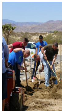
Volunteers on the project have included Marines from our 29 Palms Marine Base